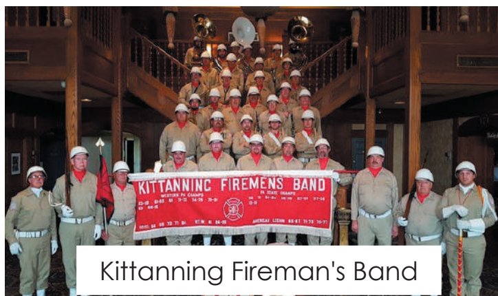
Kittanning Fireman's Band