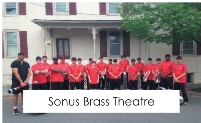
Sonus Brass Theatre