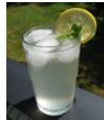
Grandma's Lemonade by NoFiller