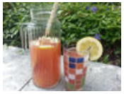
rosemary lemonade by rocket